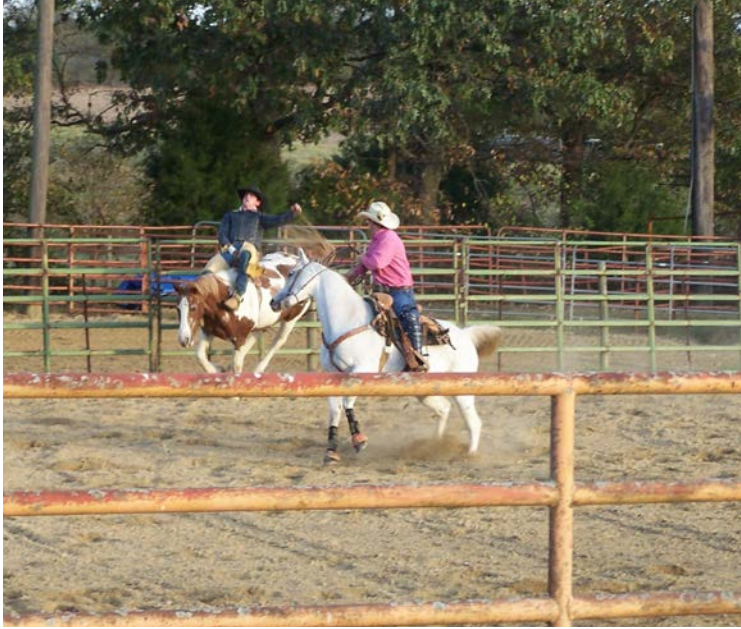
Top left: Houston Herbert spurs one and Hunter Styles gets ready to pick up.